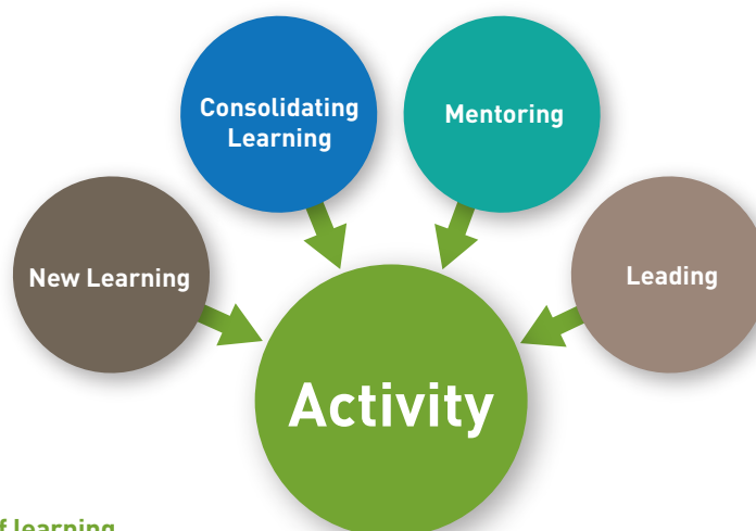
Figure 1: Types of learning

Staff who teach develop their knowledge, skills and competencies in their teaching through a range of learning activities. Each learning activity can be described by different types of learning, singly or in combination. The framework identifies and recognises four types of learning associated with any professional development learning activity ( 'new learning' , 'consolidating learning' , 'mentoring' and 'leading' ).